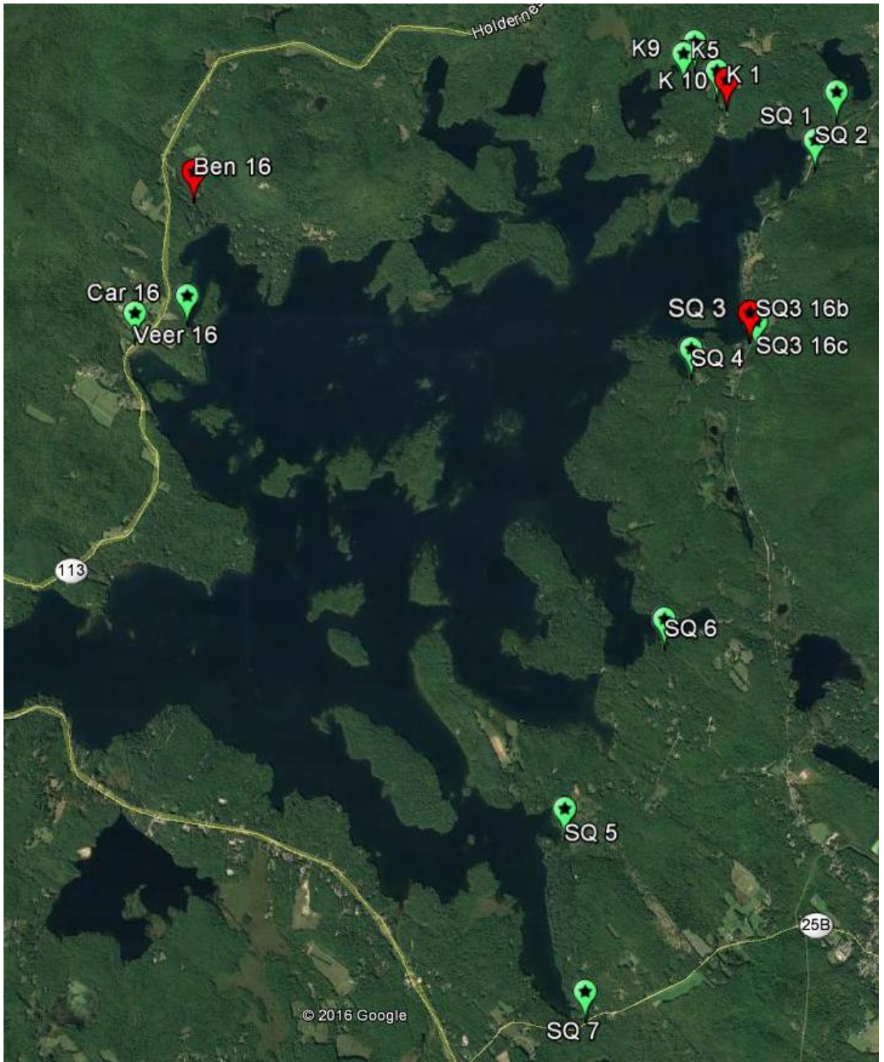
Figure 1: Locations of sediment samples in the Squam Lake watershed, collected in the fall of 2015 and 2016 and submitted for contaminant testing. Sampling sites identified with a red marker indicate areas of elevated contaminant levels, as detailed in the text.